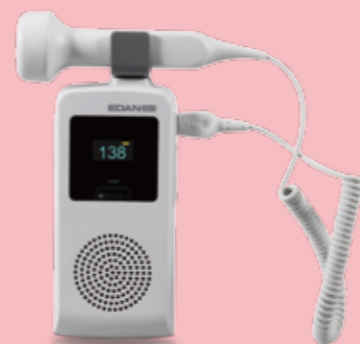
SD3 Ultrasonic Pocket Doppler