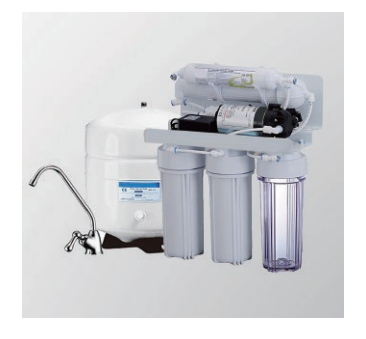
RO Water Filter (optional)