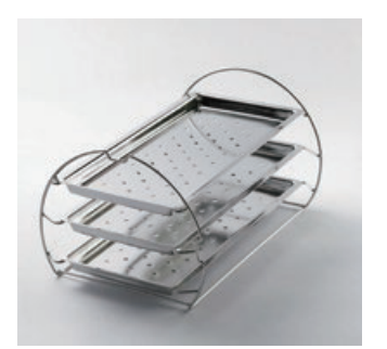
Tray Set (optional)