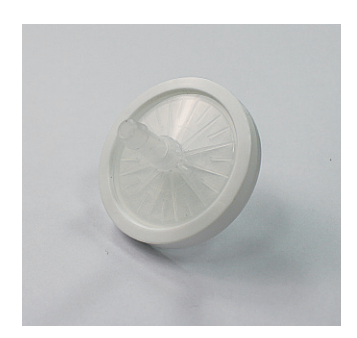
Air Filter (optional)