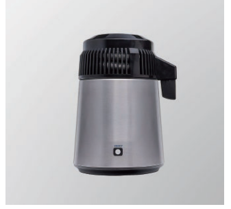
Water Distiller (optional)